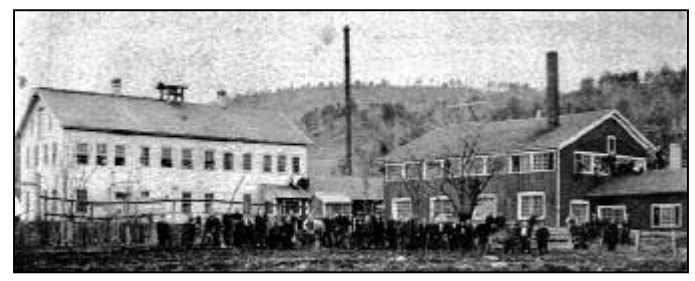
Imperial Schrade was primarily the result of the merger of the 1904founded Schrade Cutlery Company in Walden (above) and the Ulster Knife Works (top, in 1906 photo) in Ellenville.

Below, and following are a series of photos from the Ulster Knife Works ; although undated, they would appear to be mostly from the first decade of the 20<sup>th</sup> Century. They include scenes of the various departments – fabrication, assembly, sharpening, and inspection. The names of most of these workers were pencilled-in on the backs of the photos (from the Ellenville Museum's collection), and show many same-family members working together... family names still familiar in our community today.