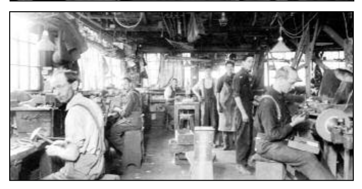
Issue 22 · Page 20